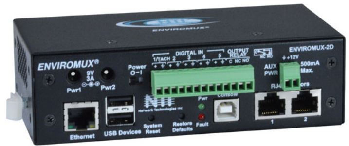
ENVIROMUX-2D (Front & Back)