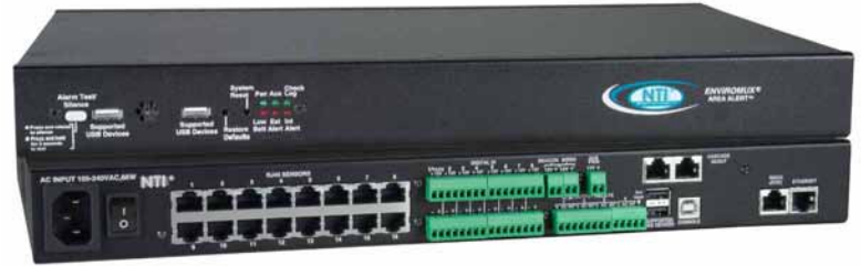
ENVIROMUX-16D (Front & Back)